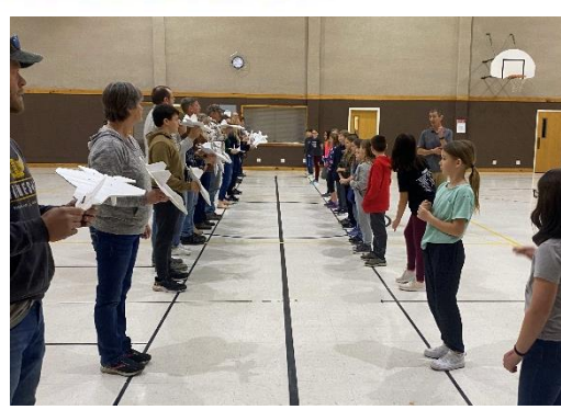
Mrs. Preble's 3^d & 4^h graders flying airplanes.